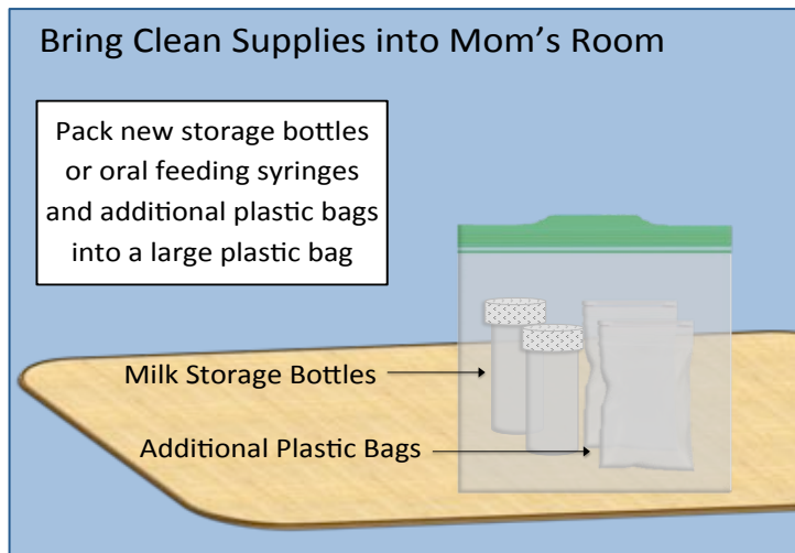
Figure 1. Supplies

*Please note, The Bottle Transfer Technique is the preferred method for transferring milk to baby.